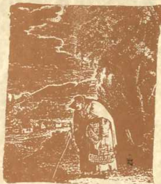
The Water-Cress Gatherer